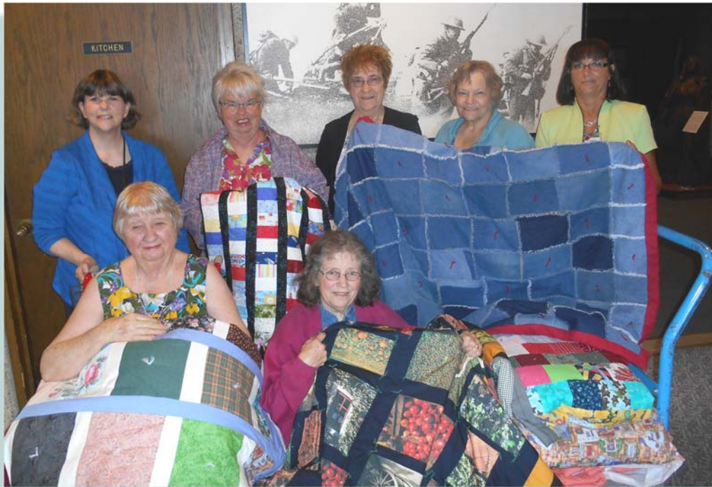
Portage County RSVP Silver Threads sewing group volunteers donate handmade quilts to veterans at the Wisconsin Veterans Home at King.

The year 2014 represented the first year of a new RSVP 3-year federal grant. The program had a federal review in 2014 that was positive and is helping guide RSVP through policy and program changes intended to enhance and improve service to our volunteers and community.